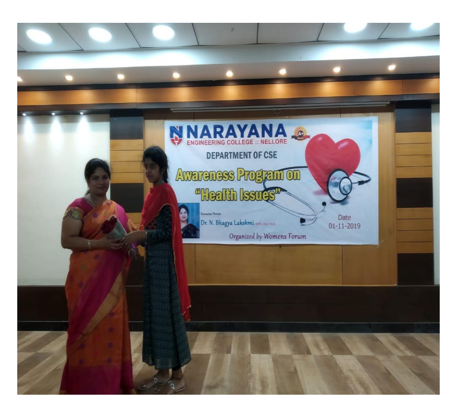
Inviting the resource Person By the student with Bouquet